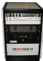
Command & Control Electronics

The C&CE provides the user interface, user control, signal processing/formatting, NUC and data/image input for all MIRAGE systems. The C&CE is a PC-based subsystem installed in a rack mount configuration.