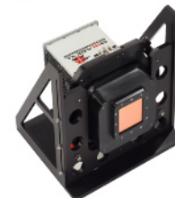
Digital Emitter Engine

The DEE is an advanced micro-emitter array. This state-of-the-art integrated circuit is constructed of thermally isolated mechanical structures with deposited thin film resistive heaters, fabricated on an advanced sub-micron silicon read-in integrated circuit (RIIC).