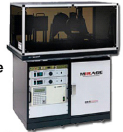
Calibration Radiometry System