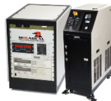
Thermal Support Subsystem & Chiller

The TSS includes power supplies, refrigerated chiller, an ion pump controller for DEE operation and a top-level ICD. Custom length cables and hoses available.